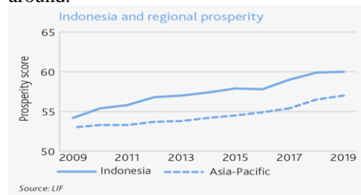
Fig. 2 The number of Indonesian Prosperity

They sell or delivering newspapers every morning. They sell snacks after or before schools. They sell plastic bags at the traditional market or became a porter, helping any women who needed help carrying their luggage to public transport in front of the market. Some of them even go for helping their parents as a beggar on the street. That's really horrible situation of the haven't. Those conditions of the haven't family and their kids, making money in so many ways no matter what, they only have their spirits and their energy to stay alive by doing that. They have no cash to start their own business, but their energy, their effort, their spirit to get profit as much as they could sometimes make their wheel off their life turned around.